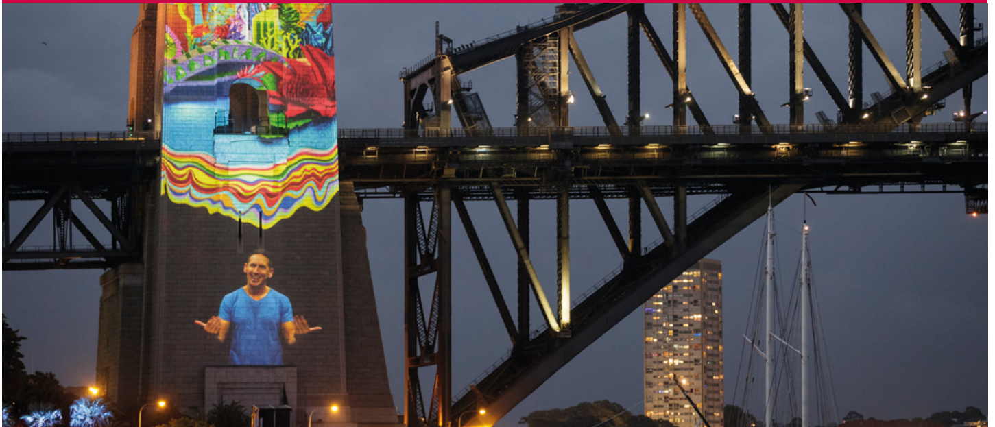
Sydney New Years Eve 2016. Auslan interpreter projected on to Sydney Harbour Bridge Pylon