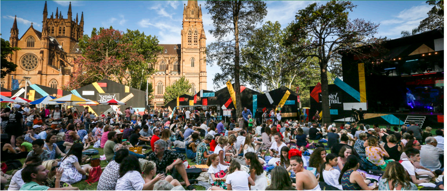
City of Sydney was a proud sponsor of the Sydney Festival 2017. Photographs of sponsorship and marketing material