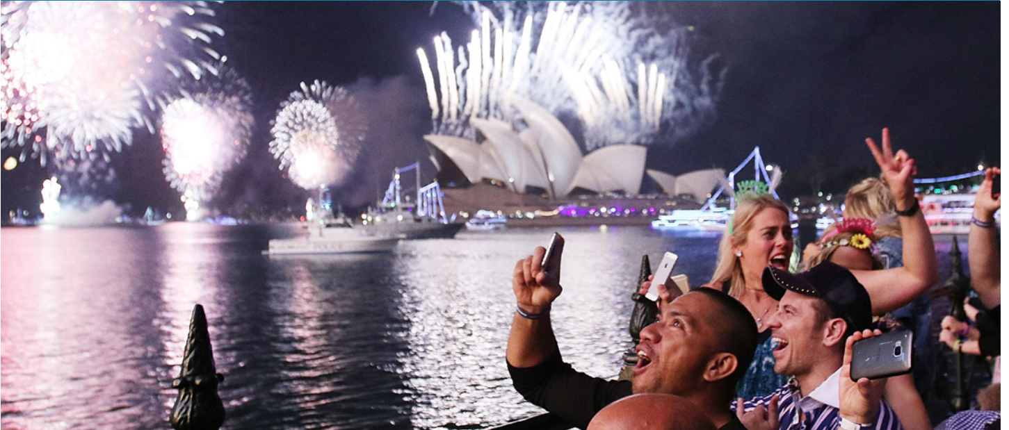
Crowds pictured at Dawes Point during the New Year's Eve fireworks, 2015

The following information that should be included on a dedicated event website: